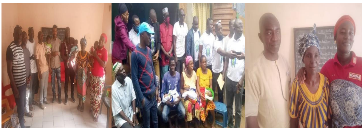
The triplets in Kankan