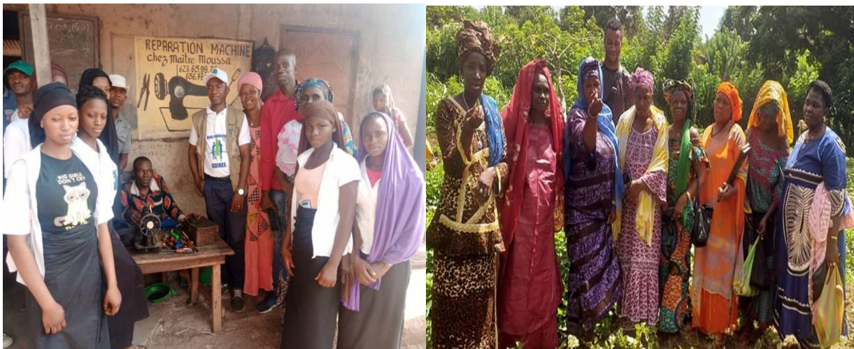
Young Girls' Learning Center

From 2019 to present, Benie Foundation INC financially and materially supported this structure of brave women which is evolved in market gardening, craftsmanship and the apprenticeship of the professions of the future to the young girls of Mamou. To date, Benie Foundation INC has contributed more than 25,000,000 GNF