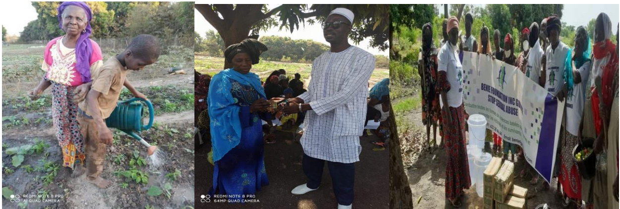
The old women of Kouroussa in their garden

To respond favorably to the request of this group, Benie Foundation is seeking for funding to complete the installation of the modern borehole planned for watering the plants at a cost of 67,000,000 GNF .