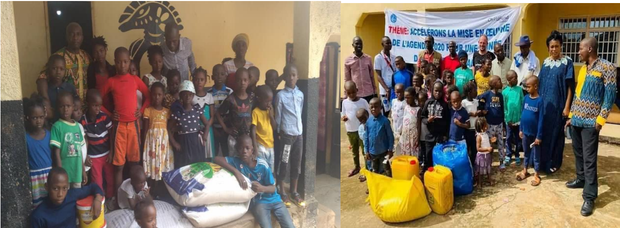
Delivery of food to Espoir des Enfants de Kindia Orphanage

This orphanage also having more than 30 children, received a support (financial, material, medical, school, psychosocial, etc) from Benie Foundation INC with a total amount of 60,000,000 GNF.