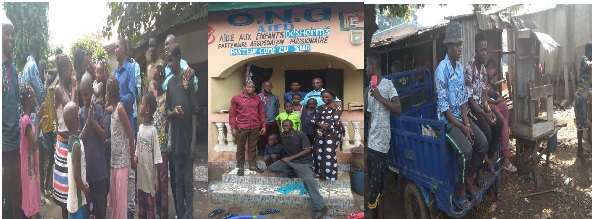
At the Bambéto center for deprived children in Conakry (2020)

This reception and learning center hosting more than 60 children has benefited from the financial support of Benie Foundation INC to the sum of 45,000,000 GNF.