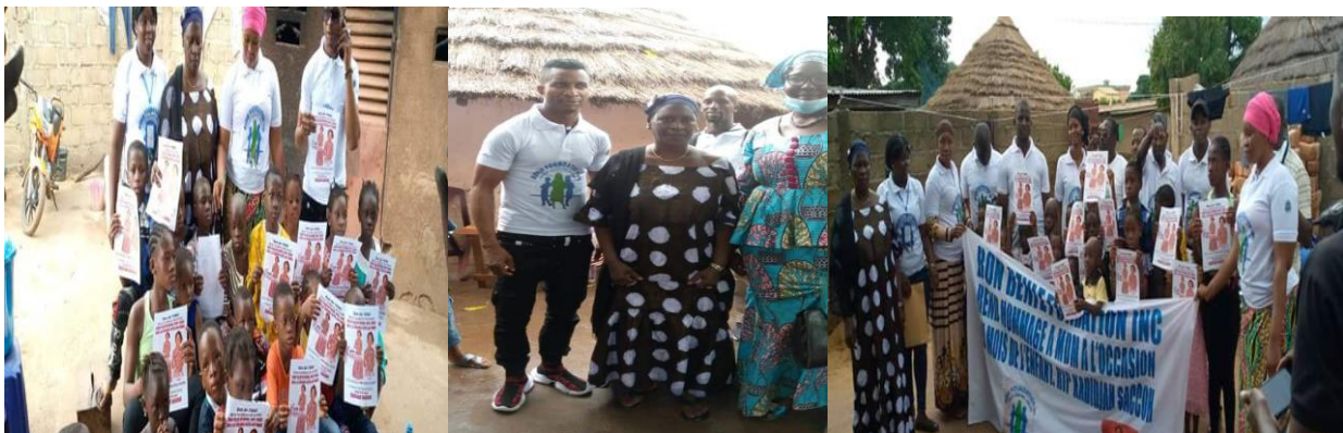
Children stand up for children

This orphanage with more than 25 children benefited from the financial support of Benie Foundation INC the amount of 5,000,000 GNF.