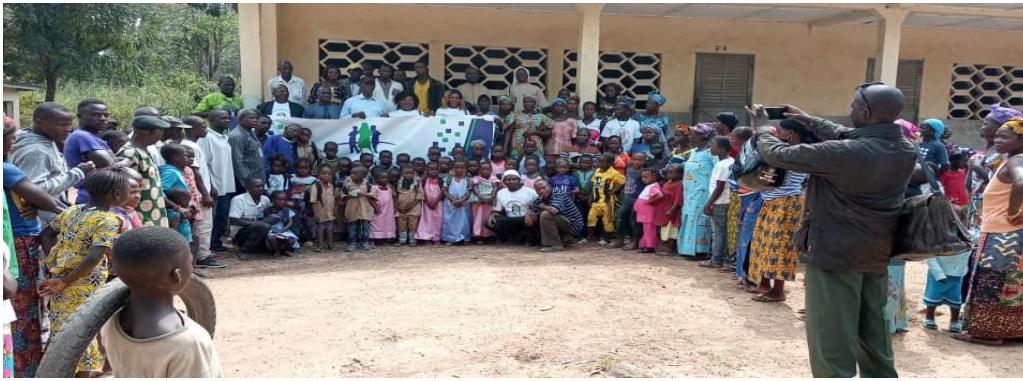
Conakry, OEE Kindia Orphanage, Kissidougou