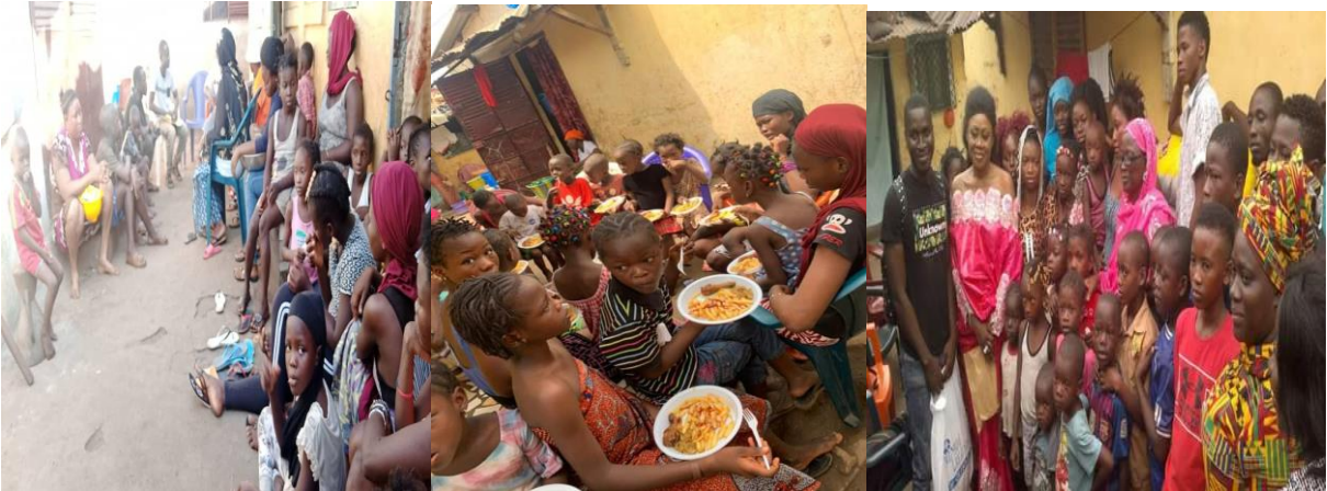
The daily life of the children of the Voix des Sans Voix orphanage

This integration and social reintegration center has more than 50 children and benefited from the support (financial, material, medical, educational, psychosocial, etc.) of Benie Foundation INC with an amount of GNF 50,000,000.