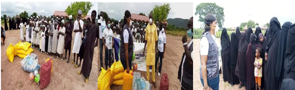
Children (boys and girls) abused in a talibé center more than 140 km from the town of Beyla

This site has more than 65 talibé, and benefited from the financial support of Benie Foundation INC the amount of 6,800,000 GNF for the return to their respective families.